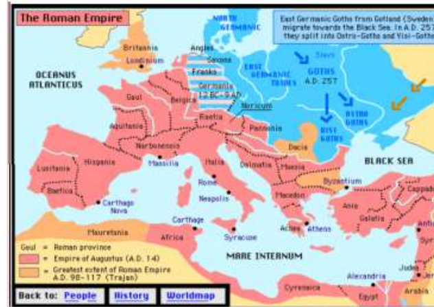
Map of the Roman Empire